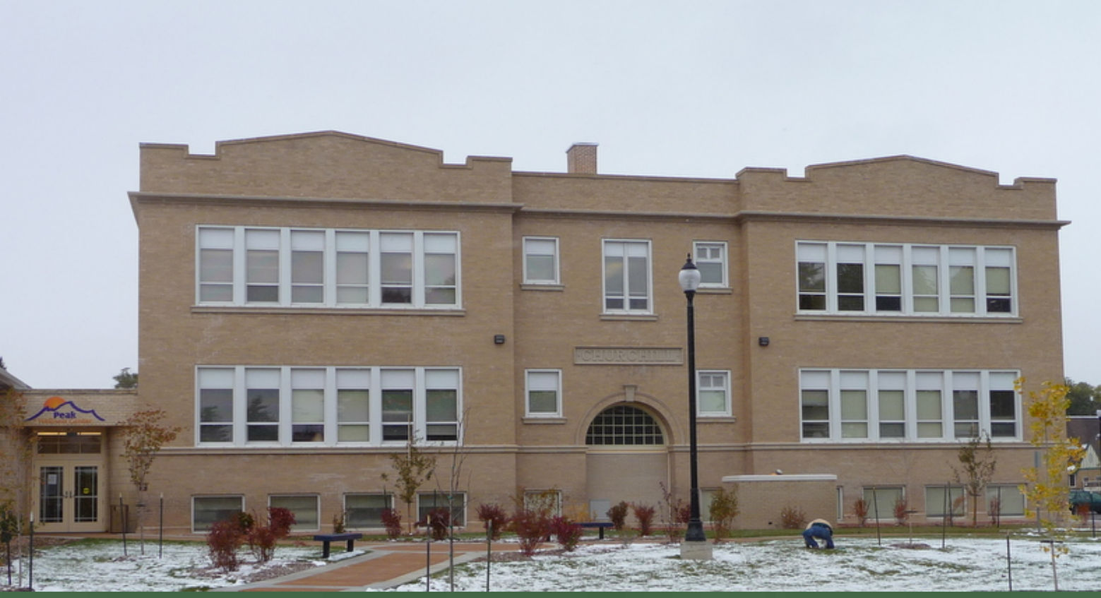
This was Churchill Elementary School in Cheyenne. The building has been repurposed and now houses medical offices that serve the community of Cheyenne.